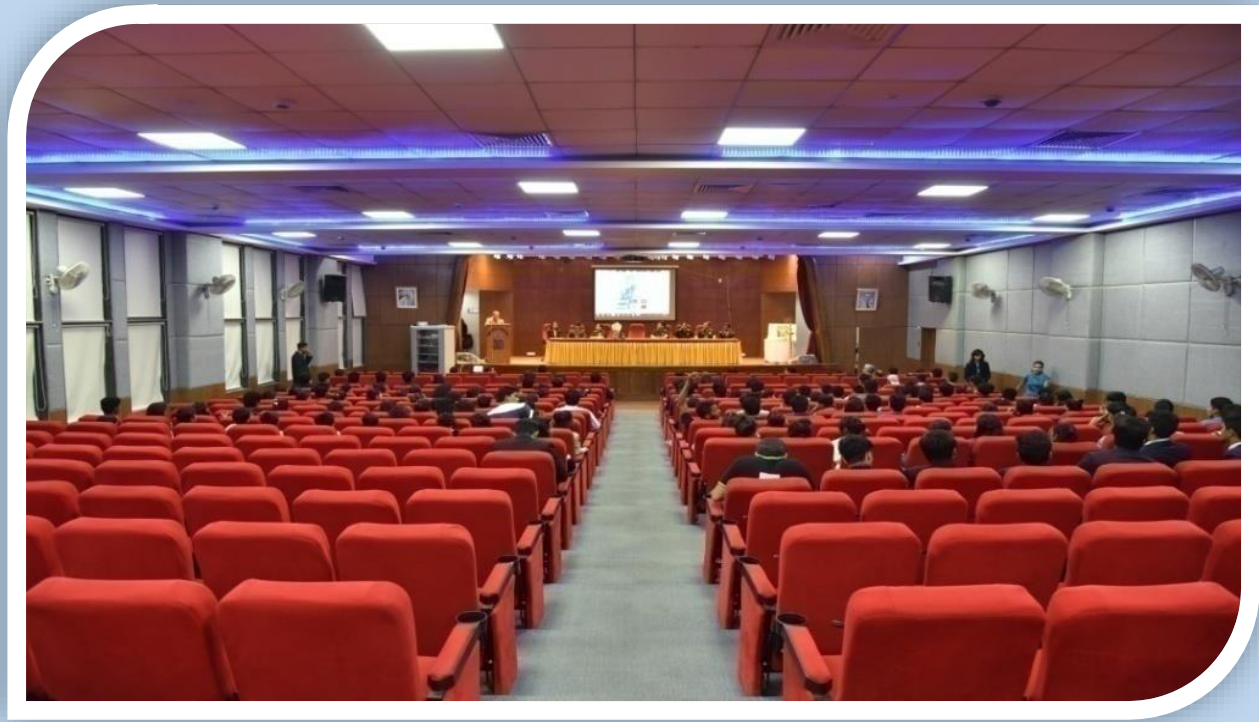
State of art Auditorium