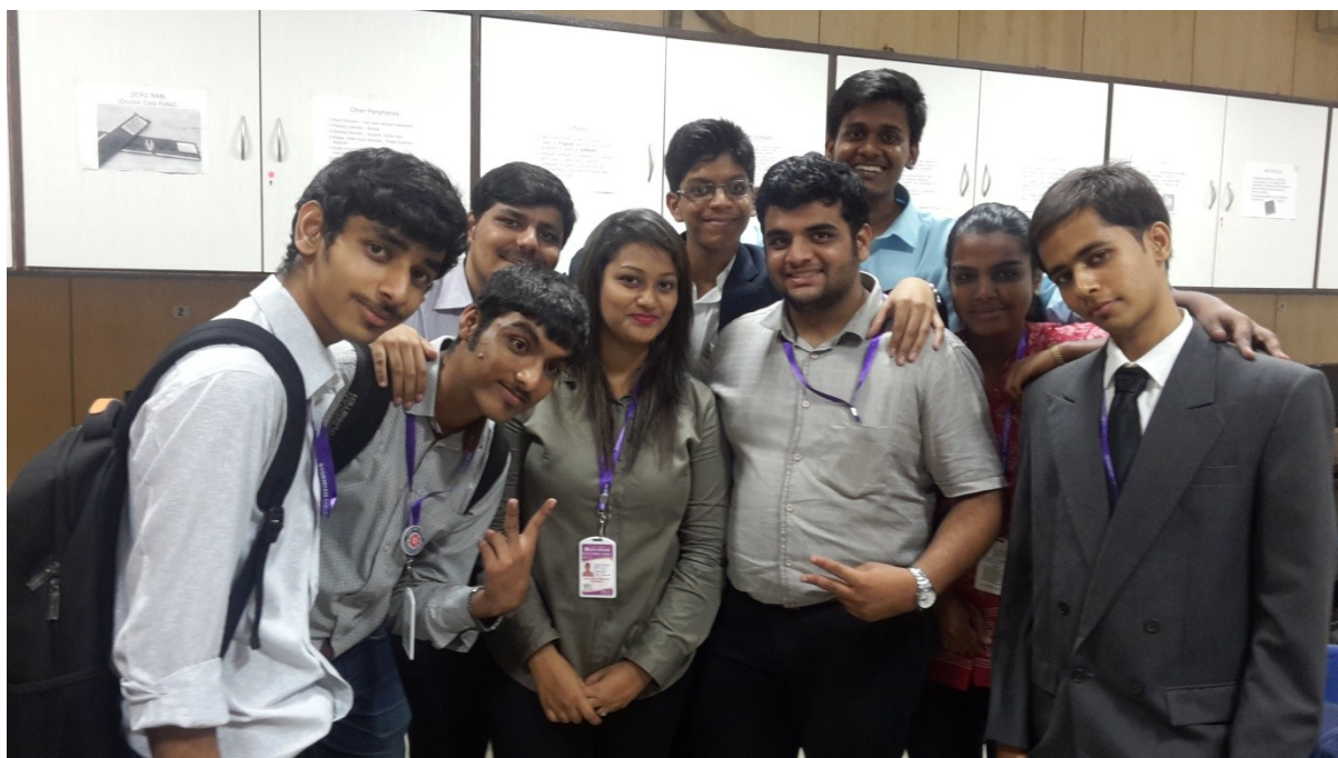
5) SCC current team with the ex- chairpersons & ex-members during Orientation on 26 th August 2016.