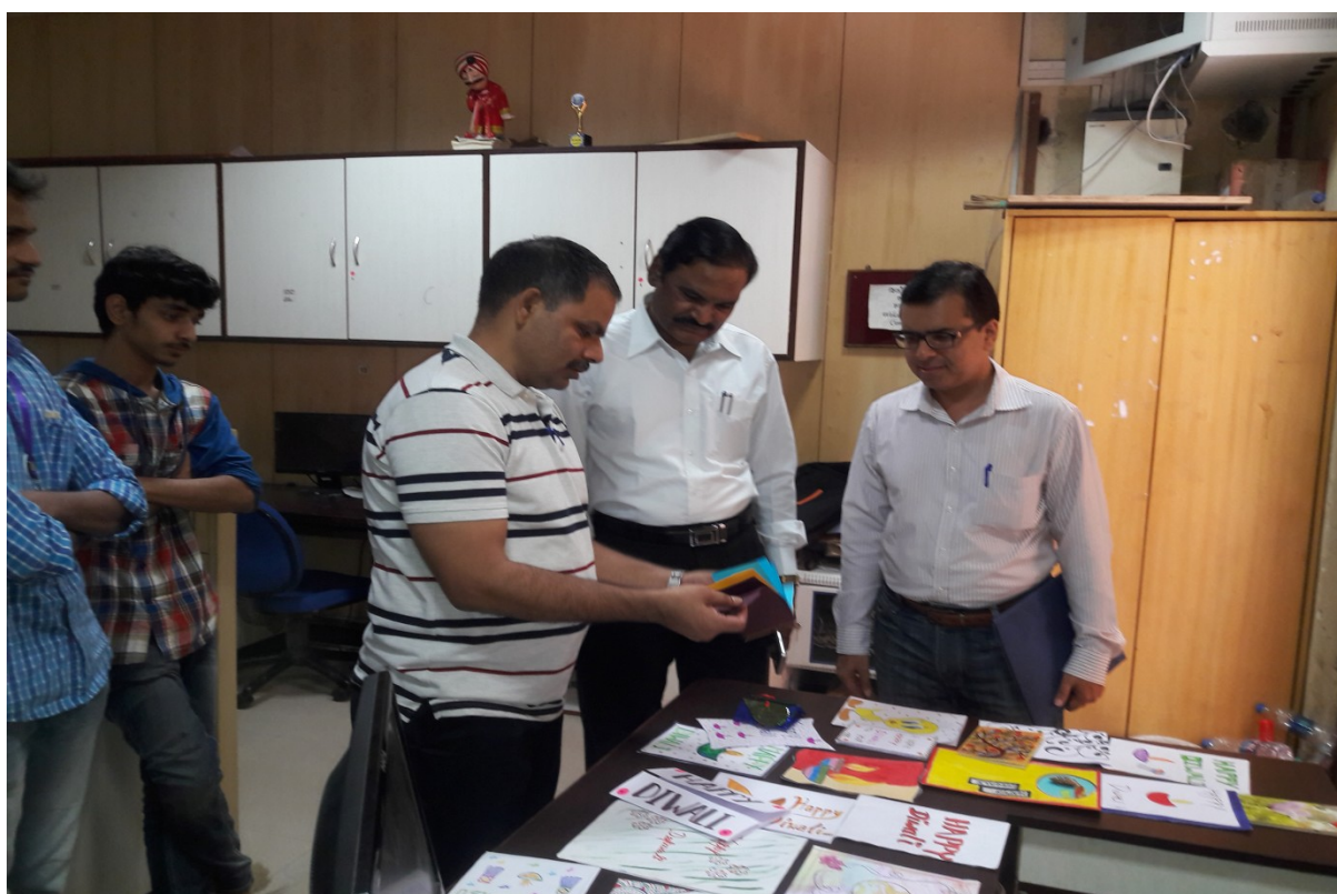
14) SCC members giving Diwali sweets to faculty members on 25 th October 2016.