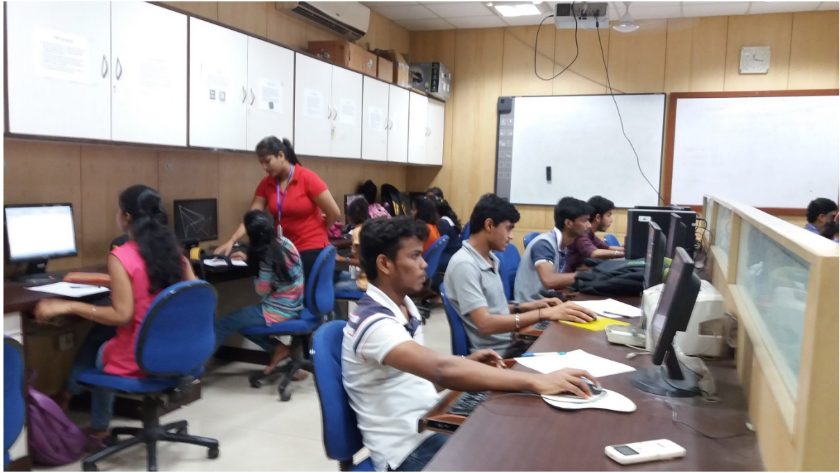
14) SCC members with other college society members. Other society members using the facility of computer lab for their DTP and PPT work.